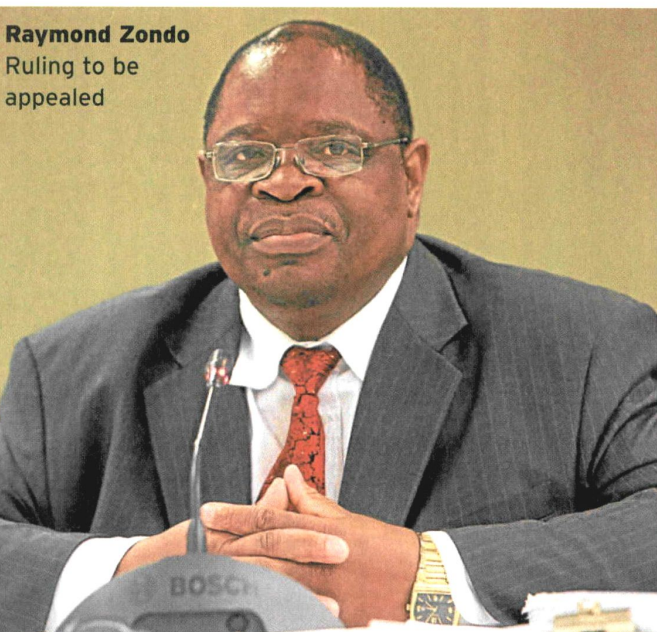
Raymond Zondo Ruling to be appealed

possible to have two separate holders of mineral rights on the same property.